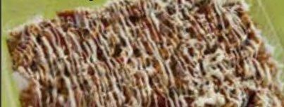
Teriyaki Chicken on Rice with Mayo