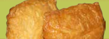
Inari Rice filled tofu pockets with a touch of avocado