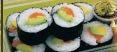
Fresh Salmon Double Avocado