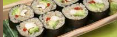
Double Avocado Chicken