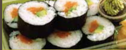
Smoked Salmon & Avocado