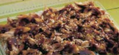
Teriyaki Chicken on Rice