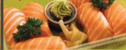
Fresh Salmon Nigiri