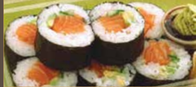
Fresh Salmon Supreme