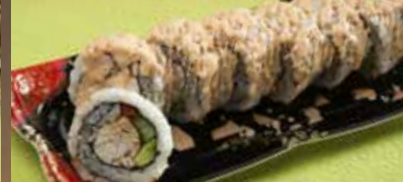
Spicy Dragon Roll