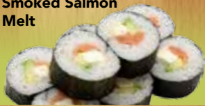
Smoked Salmon Melt