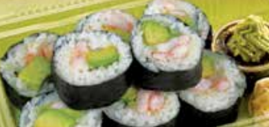
Double Avocado Prawn