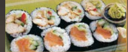
Teriyaki Chicken & Fresh Salmon