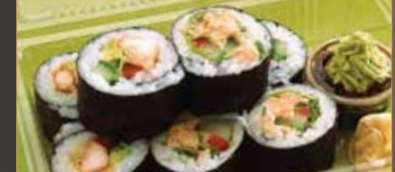
Teriyaki Chicken & Tuna Mayo