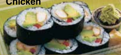
Double Avocado Teriyaki Chicken