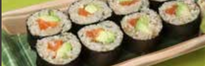
Fresh Salmon & Double Avocado

We are happy to make any sushi flavour with brown rice (add 60c)