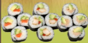
4Pc Double Avocado

Fresh Salmon Tasty Tuna Teriyaki Chicken FROM $4.50