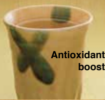
Hot Green Tea