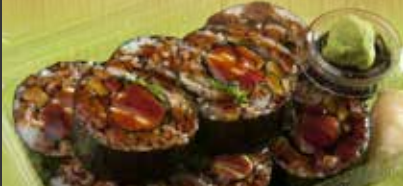
Deluxe Teriyaki Chicken