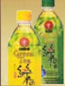
Cold Green Tea